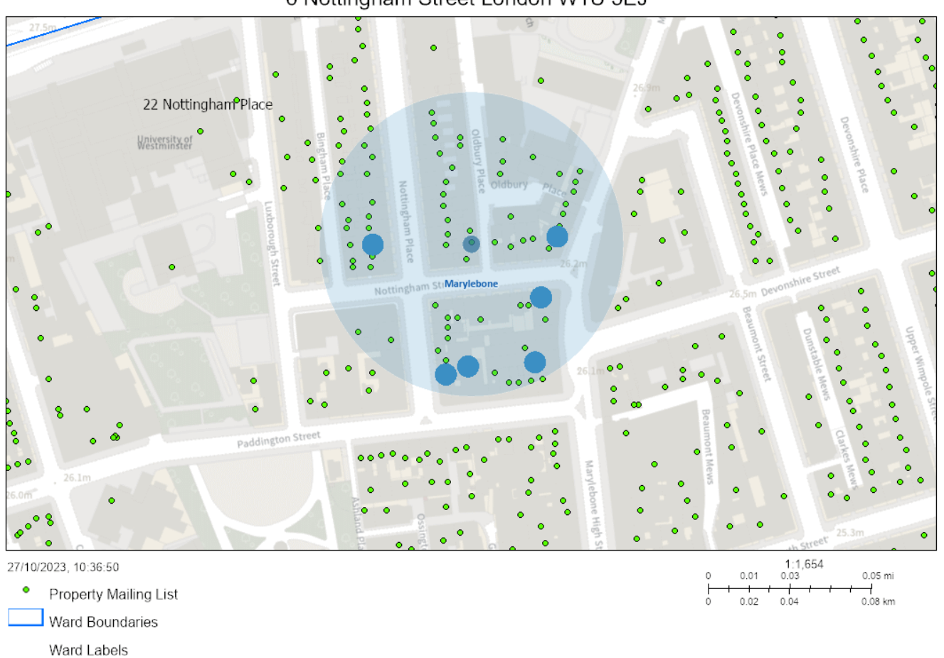
6 Nottingham Street London W1U 5EJ